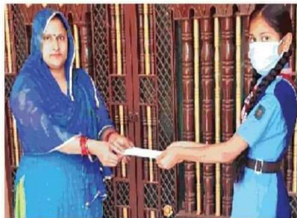
सुरीर में महिला को मास्क देती स्काउट गाइड