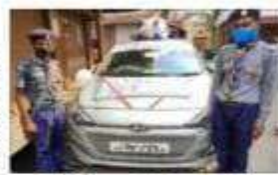
फोटो- जागरूकता अभियान चलाते छात्र

फरजाबा टाइम्स ब्यूरो पीलीभीत। उत्तर प्रदेश भारत स्काउट गाइड पीलीभीत द्वारा पिछले 31 मार्च से चले आ रहे अभियान के तहत बीसलपुर परीक्षेत्र में रोड्स एवं ईजर द्वारा मास्क बनाकर उन्हें वितरित किया गया एवं सैनिटाइजर वितरण का कार्य किया भी गया। अभियान के तहत पूरे जगह पीलीभीत में कोरोना वाहन के माध्यम से कोटेवा महामारी के प्रति लोगों को विशेष रूप में जागरूक किया गया। विभिन्न तरीके से कोरोना वायरस से बचाव को बताया गया साथ ही लोगों से अपील की गई कि प्रशासन का सहयोग करें। प्रशासन के