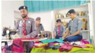
स्काउट गाइडों को बैंक एवं सहकारी राशन की दुकानों के सामने सेवार्थ के लिए नियुक्त किया गया है।

(राजस्थान संवाददाता) स्काउट गाइड एवं गैर-सरकारी संगठनों को जिला स्तर पर कोरोना लॉकडाउन में सेवा देने में काम रहे हैं। जिला स्तर पर 100 से अधिक स्काउट गाइडों को बैंक एवं सहकारी राशन की दुकानों के सामने सेवार्थ के लिए नियुक्त किया गया है। जिला स्तर पर 100 से अधिक स्काउट गाइडों को बैंक एवं सहकारी राशन की दुकानों के सामने सेवार्थ के लिए नियुक्त किया गया है। जिला स्तर पर 100 से अधिक स्काउट गाइडों को बैंक एवं सहकारी राशन की दुकानों के सामने सेवार्थ के लिए नियुक्त किया गया है।